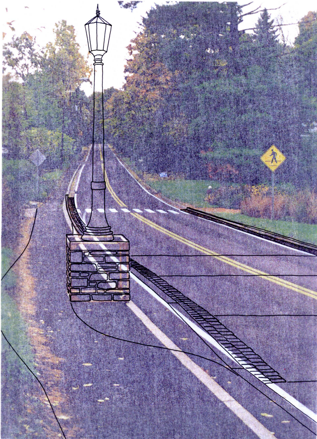
Community Entrance Feature, Judd Falls Road, Detail