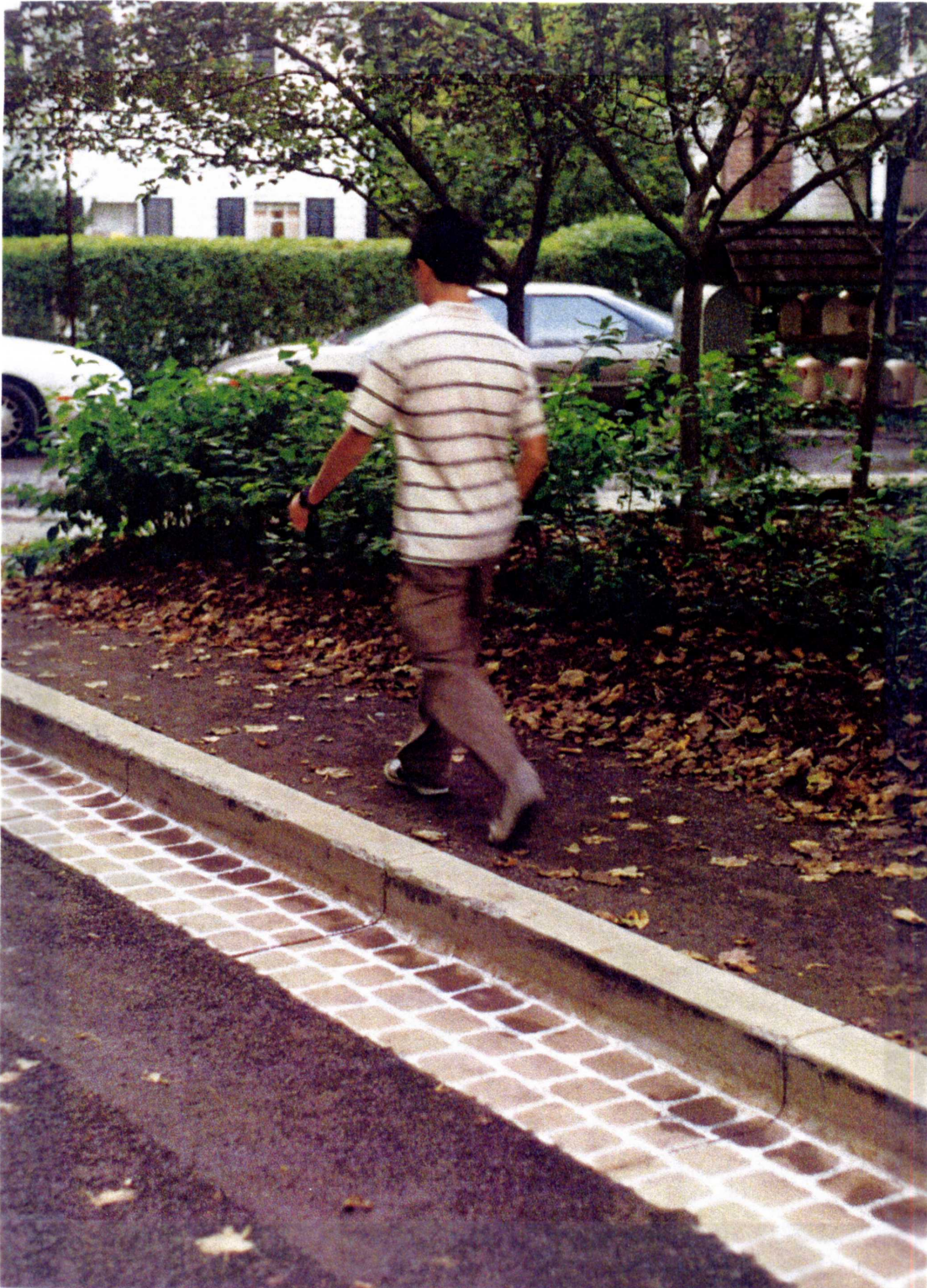
Cobbled Shoulder Band, 18 Inches Wide, Shown with Curb