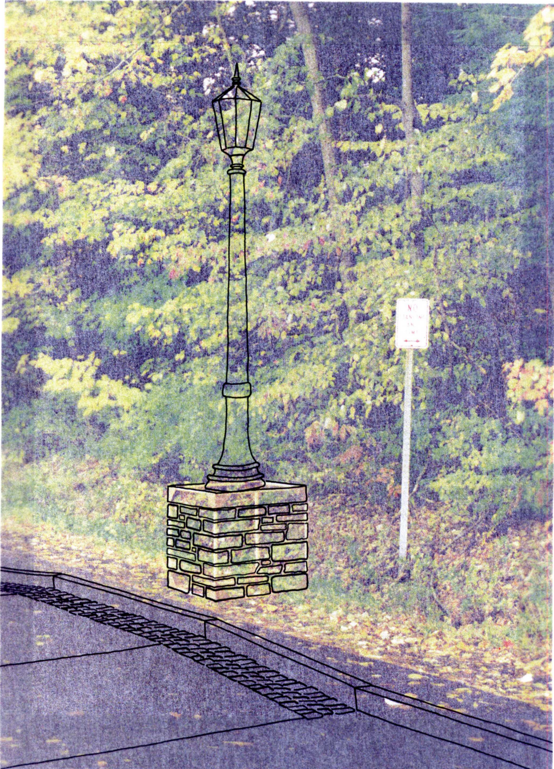
Community Entrance Feature, 100 Block Forest Home Drive, Detail